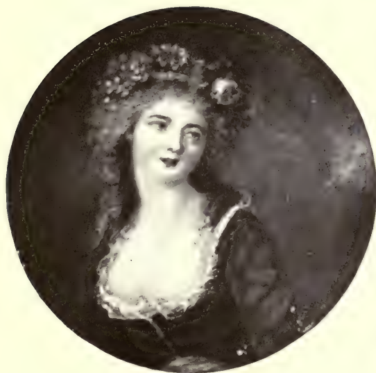
THE COUNTESS SOPHIE POTOČKI (Ob. 1822) BY P. A. HALL